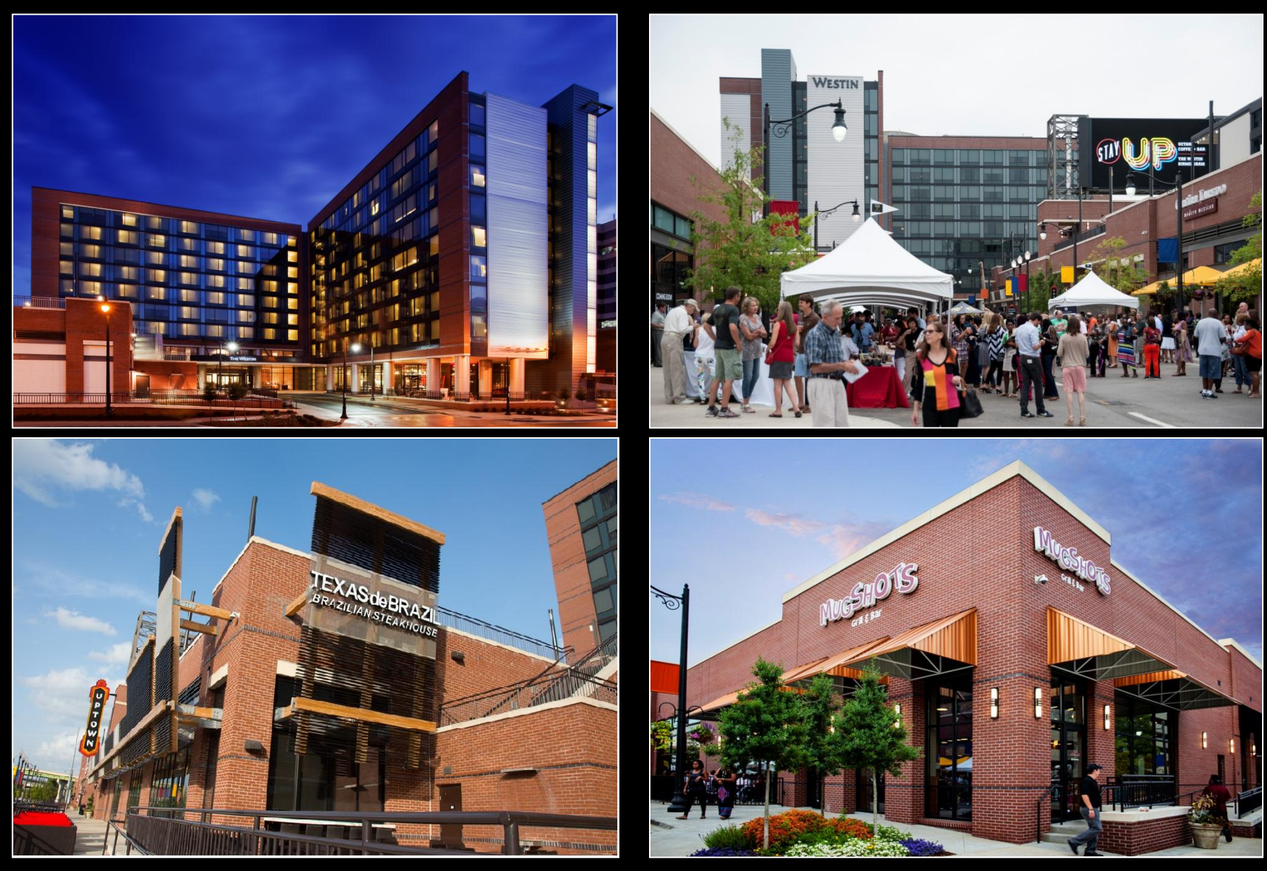
BJCC attracts 1.5 million people annually